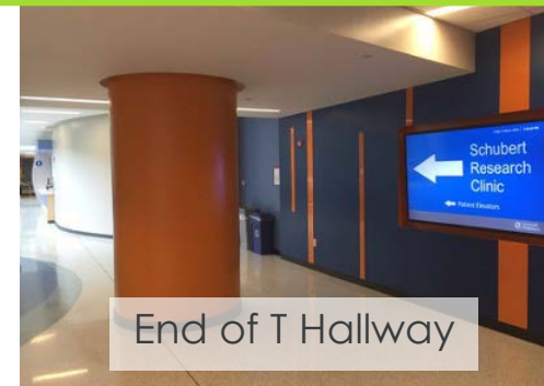
End of T Hallway