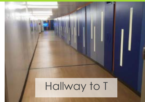
Hallway to T