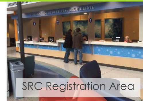
SRC Registration Area